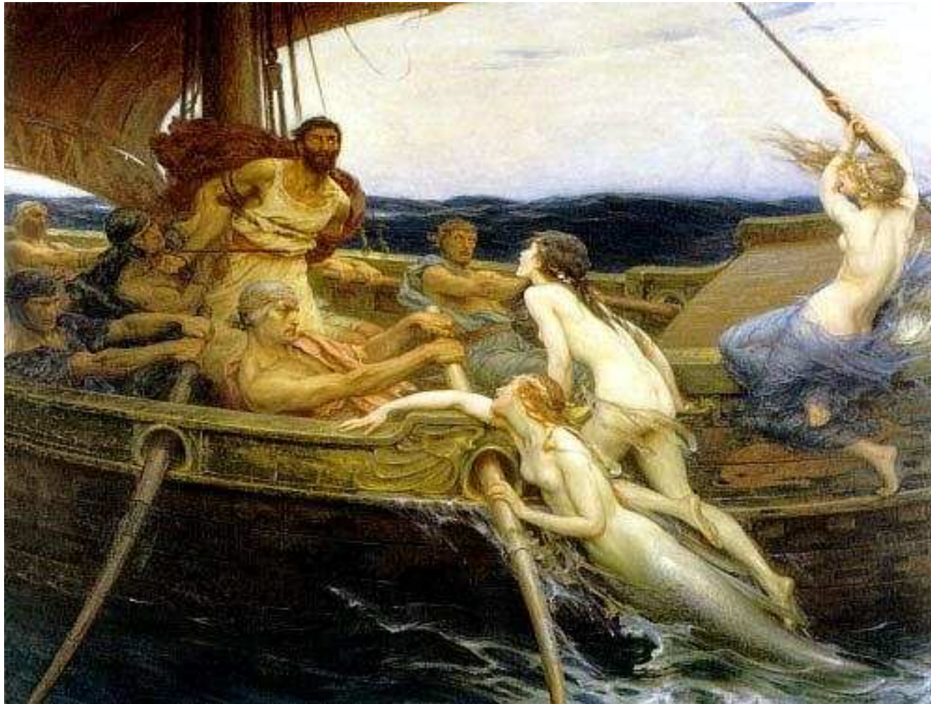
Odysseus and the Sirens'. Herbert James Draper, 1909